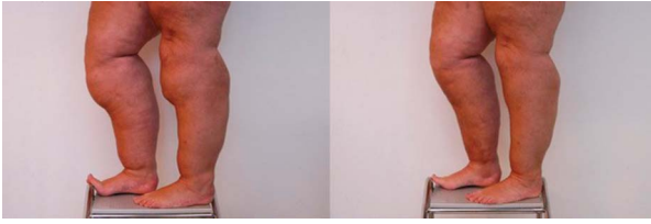
Figure 8. A 42-year-old woman demonstrates typical lipedema with enlargement of both legs. The girth of both legs has been reduced after multiple liposuction procedures using tumescent local anesthesia. Total volume of supranatant fat removed was 5.5 L.

Low-impact active movements may begin when all liposuction incisions are closed or healed. These activities can include walking, aqua-gymnastics, swimming, and gymnastics.