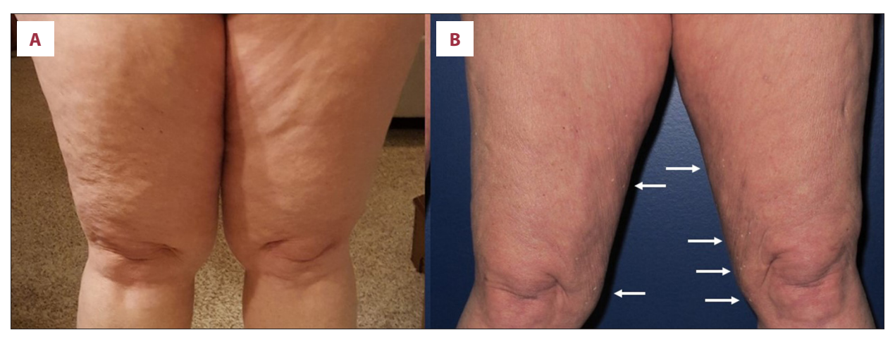
Figure 1. Case 1 legs before (A) and after (B) suction lipectomy. The left side of the photo shows subcutaneous hypertrophy is visible in a column shape on the front of the thighs and slightly overhanging the knees prior to suction lipectomy. Right side of the photo shows thighs 6 months after surgery with arrows pointing to verrucous skin changes indicative of lymphedema.