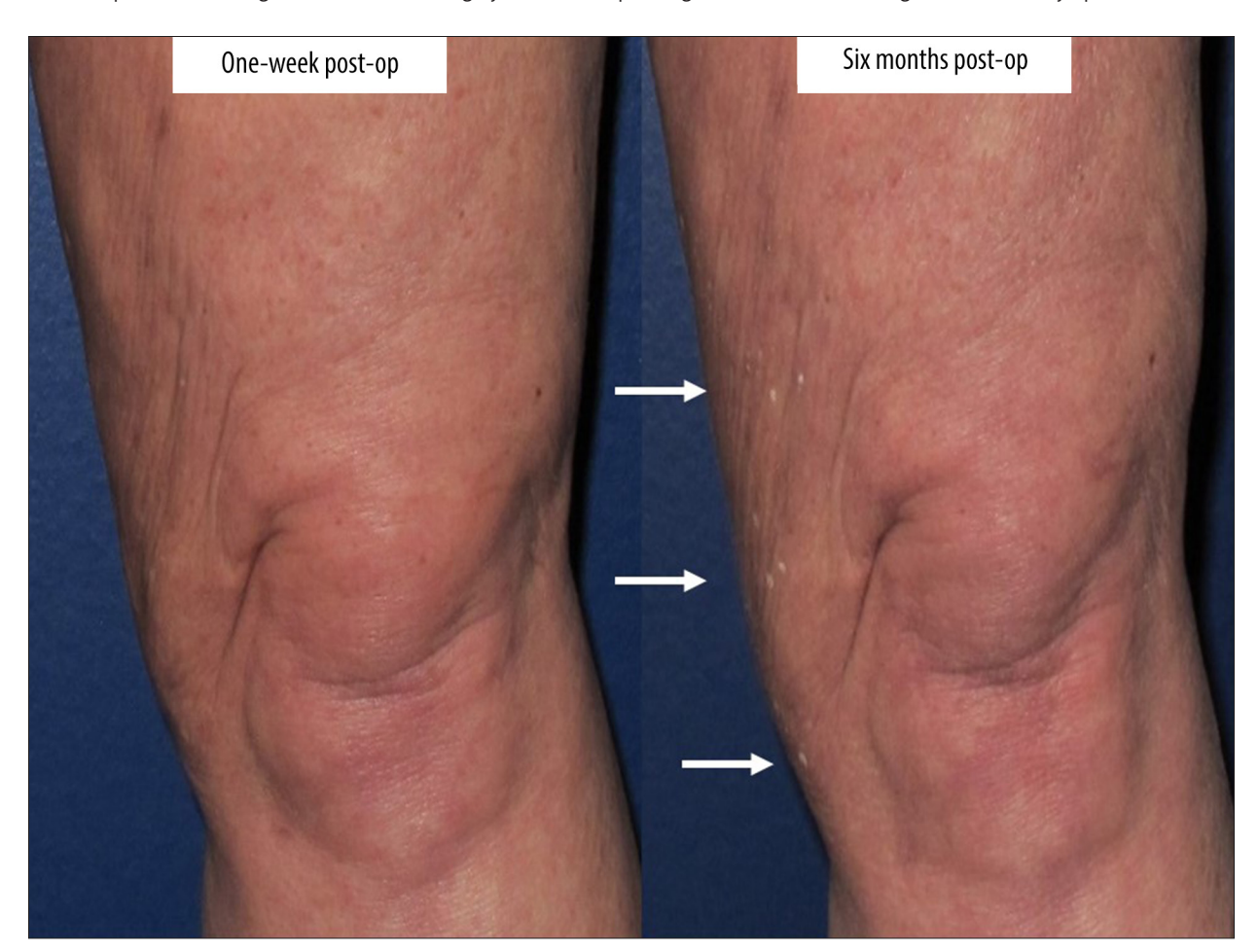
Figure 2. Photo of Case 1 left legs 1 week and 6 months after surgery. No verrucous skin changes were seen prior to surgery but are visible 6 months after surgery. The skin changes include dermal fibrosis, hyperkeratosis, and dermal papillomatosis on the anterior medial thigh (arrows).