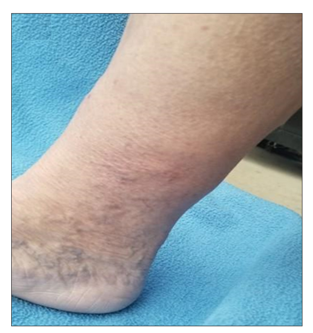
Figure 6. Close-up of left lateral ankle and lower leg of Case 3. Notice the slight erythema, hyperkeratosis, and papillomatosis of the skin. Swelling is evident with loss of landmarks of the lateral malleolus. Note the venous telangiectasias on the foot, which also developed after the suction lipectomy.

WAL of her arms and calves to ankles, with a total of 6 liters of aspirate removed, of which 5350 cc was primarily fat. Six months later, she had WAL on her inner and anterior thighs, hips, and knees with a total removal of 7200 cc of aspirate, with 6700 cc being primarily fat. After an additional 6 months, she had WAL suction lipectomy to her knees, lower posterior thighs, and ankles, and 1800 cc of total aspirate was removed; the supernatant was 1400 cc. Over the year following her last surgery, she developed persistent dermal sclerosis, dermal hyperkeratosis, persistent pigment irregularities, and intermittent swelling in her lateral left ankle and lower leg (Figure 6). Her diagnosis of lipedema was confirmed by a lipedema and lymphatic specialist following criteria by Wold [17]. She was also diagnosed with Stage 2 lymphedema by ISL criteria [10].