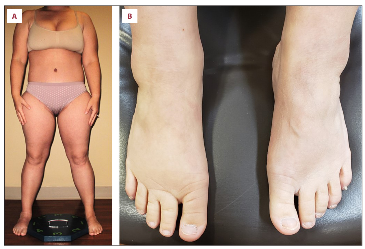
Figure 4. Combined pictures of Case 2. Whole-body view of Case 2 showing swelling of the right ankle and foot 6 months post operatively (A). Close-up of the feet (B) shows the normal left foot and the right foot and ankle with swelling and with loss of vascular landmarks, hyperkeratosis with thickening of the extensor creases on the top of the foot especially noticeable on the base of the toes.